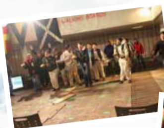
Playing games with paper plates and apples

they, themselves, are helping to build. The girls were in flawless bridal dress and the guys straightened their ties. When interviewed, one of the bridegrooms said, with a captivating smile, "We are having this grand wedding ceremony thanks to the careful planning and organization of COSCO (Guangdong). We feel, and are grateful for, the great care COSCO (Guangdong) takes of its employees. This is the most romantic Christmas ever!"