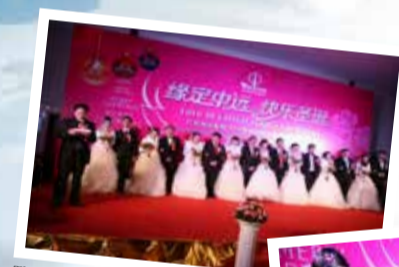
The yard's party secretary ties the knot for the newlyweds