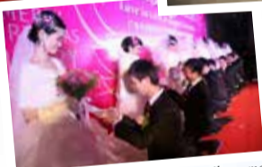
Darling, will you marry me?