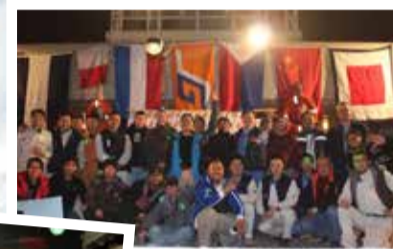
Winning the game!