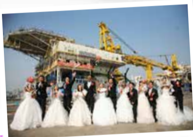
The tender drilling rig is a witness of our happiness