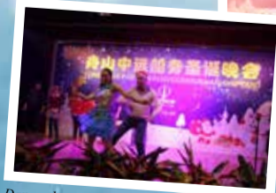
Dance, dance, dance!